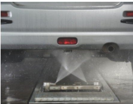
with integrated UNDER CHASSIS WASHER (Optional)