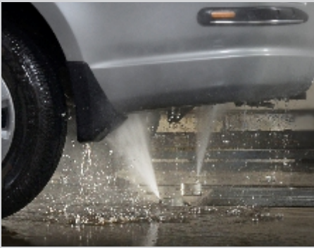
Low water consumption 24 litres per car