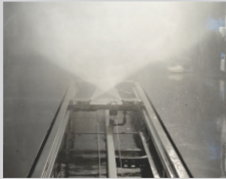
High operating pressure of 55 bar for effective cleaning