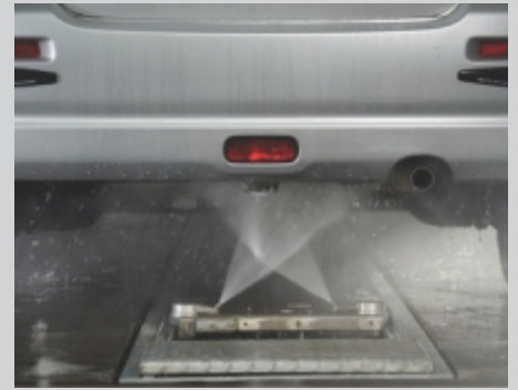
Rotating dual nozzle for better reach