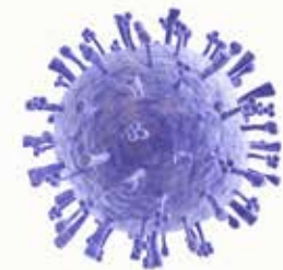
Viruses and microparasites

Antibacterial filter with silver ions (Ag + ions)