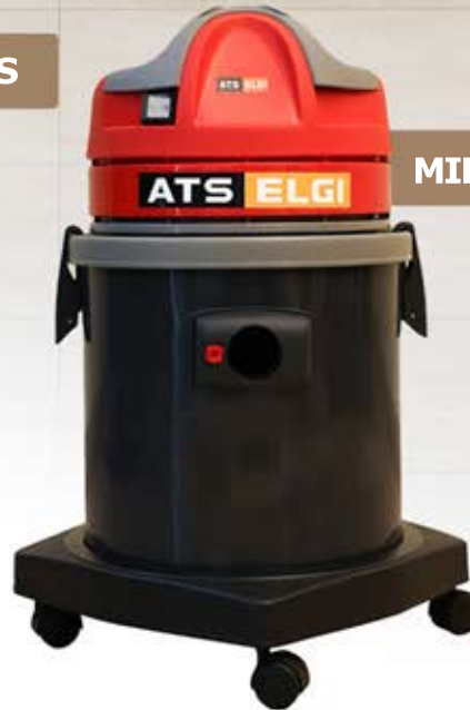
MID VAC- 37 LTRS