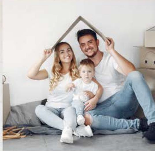
HOME & PERSONAL CARE