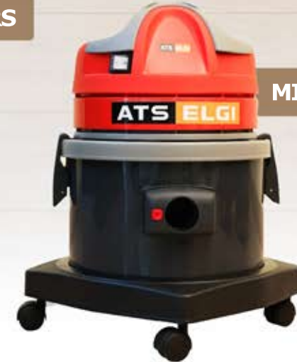
MINI VAC- 17 LTRS