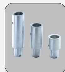
Drop in adaptor Optional