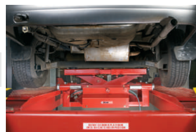
Wheels free arrangement (Jacking beam)