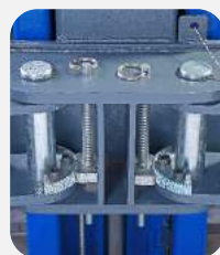
Arm Locking Mechanism