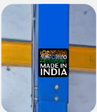
Made in India