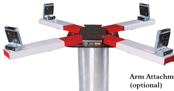
Arm Attachment (optional)