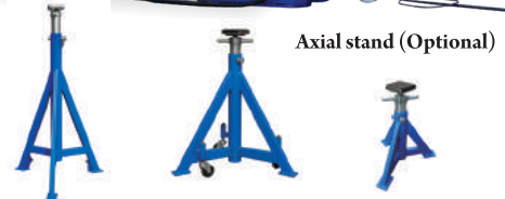
Axial stand (Optional)