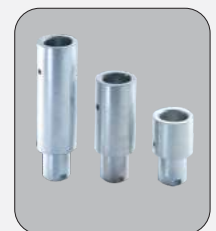
Drop in adaptor Optional