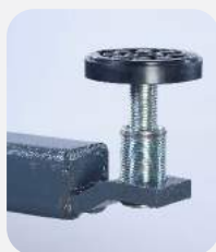
Telescopic Arm pad