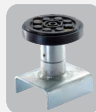
XUV 500 Adapters - Optional