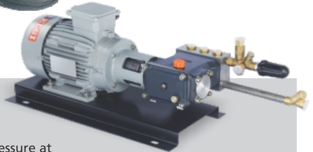
HL 03 045 ▲