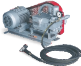
▲ P 36/30