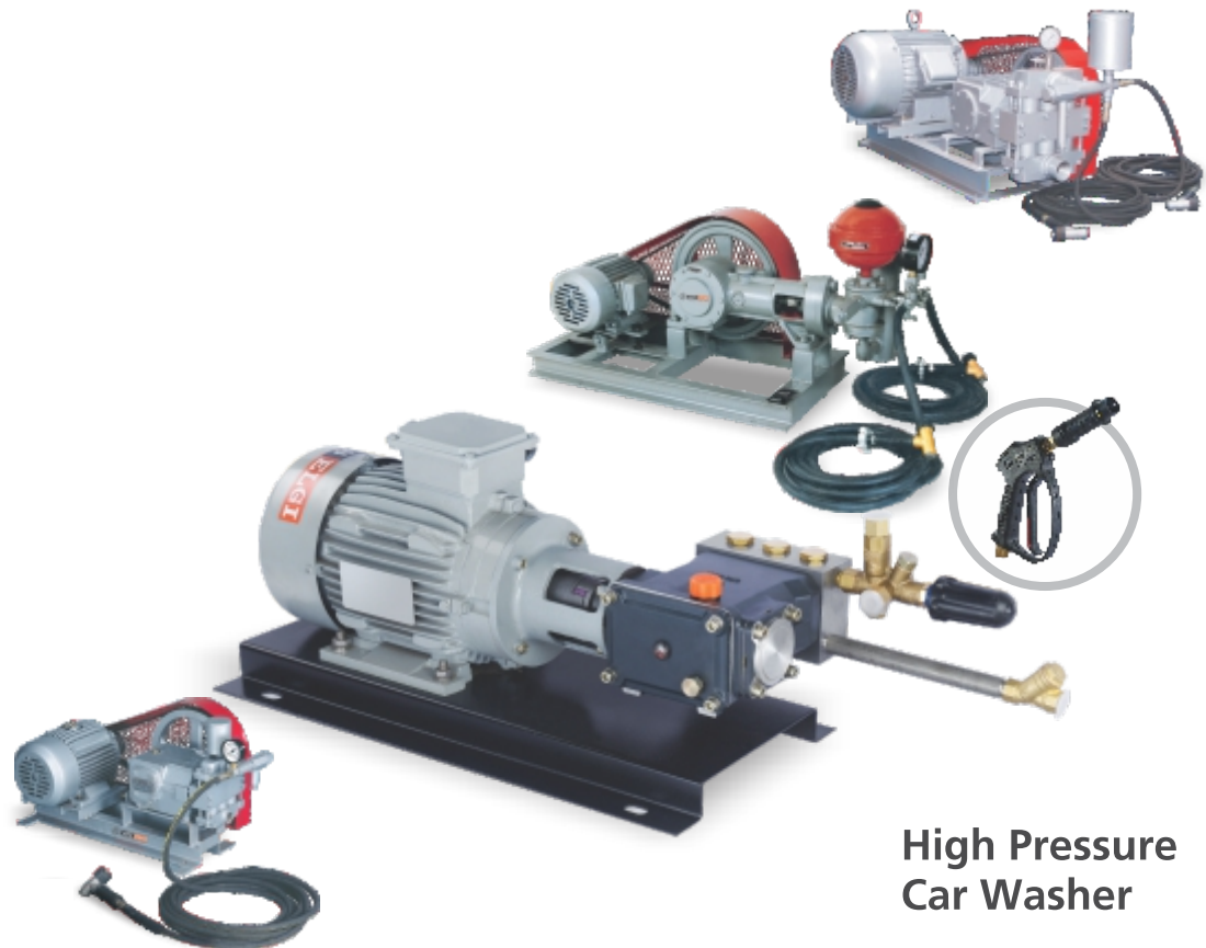
High Pressure Car Washer