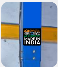
Made in India