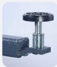
Telescopic Arm pad