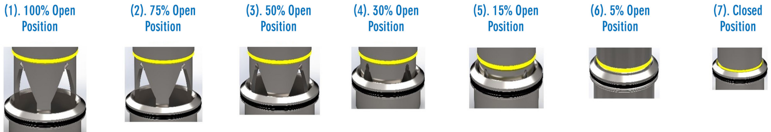
Figure 1: V-Port Open Positions At Incremental Percentages

In most water reticulation and piping applications, most valves will always experience cavitation at the initial opening and final closing stages. The LFC™_3B Excess flow shutdown valve has been designed to reduce the effects of cavitation on the seating areas by the use of a specially designed V-port device which work in conjunction with the Plug assembly. The Images below shows various open positions of the LFC™_3B Excess flow shutdown valve's V-port arrangement. This is shown at incremental percentages for illustration purposes.