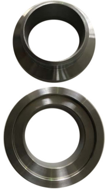
Butt welded hubs