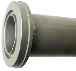
Grooved butt welded hub, welded to pipe