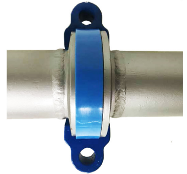
1 x half clamp assembled with hubs, O-Ring and locating ring