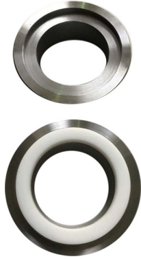
Butt welded hubs & compression seal