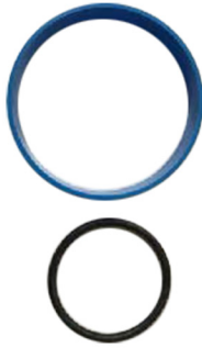
Locating ring & O-Ring (seal)