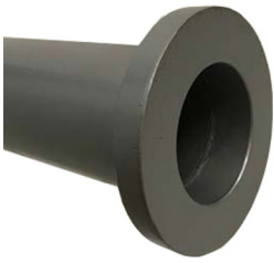
Plain ended butt welded hub, welded to pipe