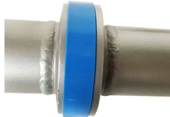
Hubs, O-Ring and locating ring assembled