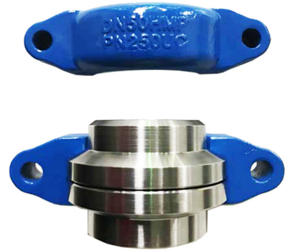
1 x half clamp with hubs assembled