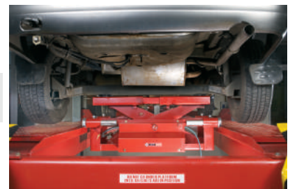
Wheels free arrangement (Jacking beam)