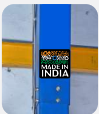
Made in India